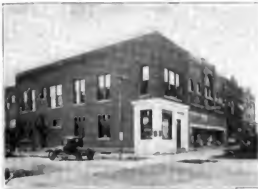
FIRST NATIONAL BANK, BRITT